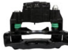
CALIPER - FREIO A DISCO CALIPER - FREIO A DISCO BRAKE DISC CALIPER