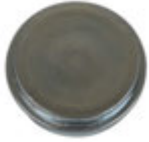
TAMPA MENOR TAMPA MENOR SMALLER CAP

WABCO: 0013230085 NTI: 023072 | WABCO: 0013230085